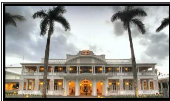
Grand Pacific Hotel,

Treatment is usually resolved by sending the suffering alcoholic to a mental institution or being cast away from the church as a morally depraved person..