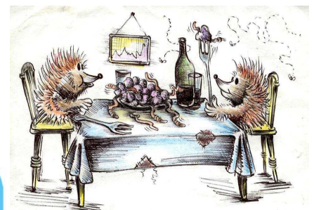
Eve of hibernation dinner

I got drunk last night and my house wasn't where I left it